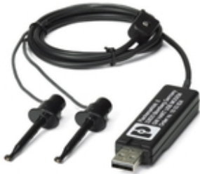
USB HART modem cable for communication between a PC and HART devices, cable length: 1m.

Please be informed that the data shown in this PDF Document is generated from our Online Catalog. Please find the complete data in the user's documentation. Our General Terms of Use for Downloads are valid ( http://phoenixcontact.com/download )